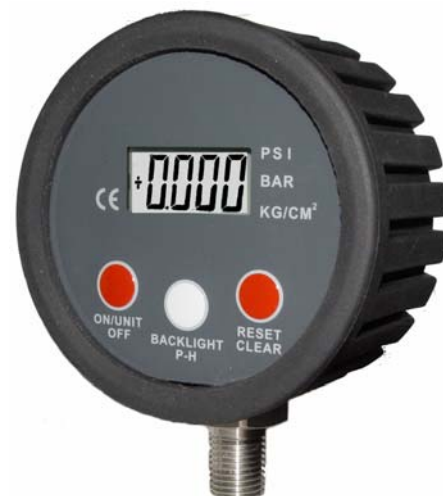
(Pictured with optional rubber cover)